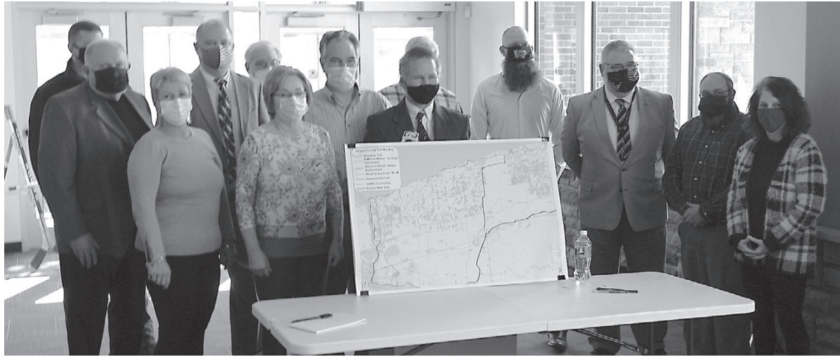
Municipal leaders of the Northern Niagara Regional Trail Network gather for a group photo.