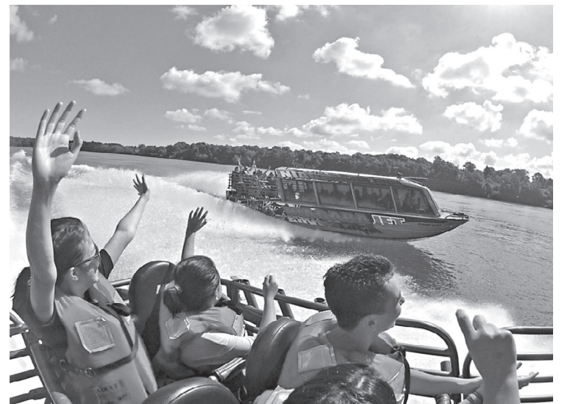
Niagara Jet Adventures is opening for the season.

With almost a decade of whitewater touring experience in some of the most intense rapids in the U.S., USA Today ranked Niagara Jet City Cruises one of America's