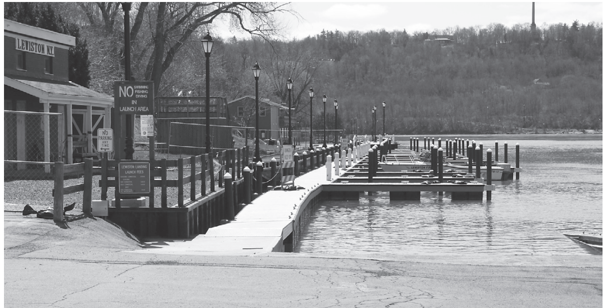
A look at the Village of Lewiston waterfront.