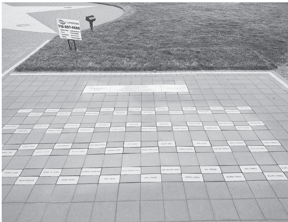
The Civil War veterans from Grand Island are recognized at the DeGlopper Memorial.