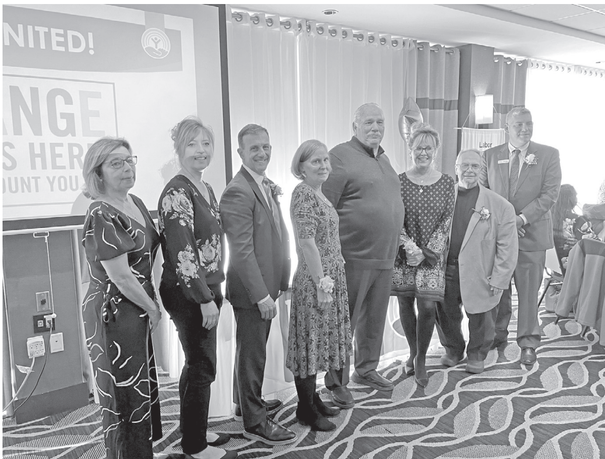
United Way leaders and honorees

In addition to serving as the official start of United Way's annual campaign in across Niagara County and the Tonawandas, this event also honored local organizations and individuals who have helped to make a difference in the Greater Niagara Community over the past year. This year's awards and honorees include the President's Award to the AFL/CIO Niagara/Orleans Central Labor Council, the Horizon Award to KeyBank, the Shining Star Award to Highmark Blue Cross Blue Shield of Western New