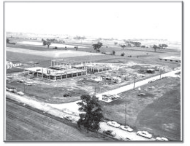
Bldg 901 1956