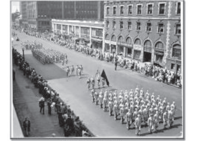
Memorial Day 1951