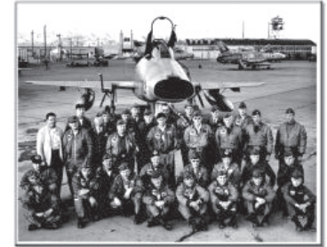
F-100 Pilots 1960