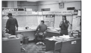
Maintenance Operation 1982