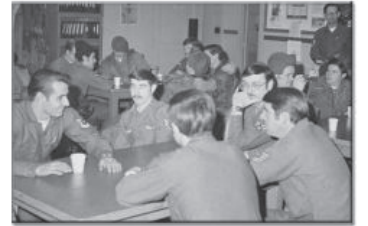
Crew Chiefs 1982