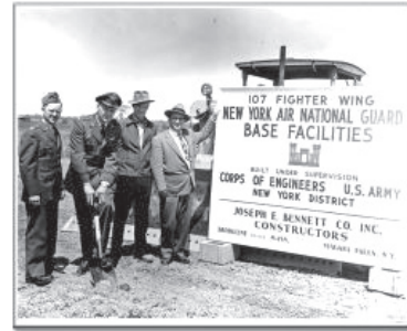
Ground Breaking 1954

The Niagara Military Affairs Council (NIMAC) is a nonprofit organization that works to support the growth and prosperity of the Niagara Falls Air Reserve Station (NFARS) and its personnel, creating a positive economic impact on the Western New York Community. Founded in 1996 as a result of the 1995 Base Realignment and Closure Commission (BRACC), NIMAC continues to support and promote capital investment by the federal