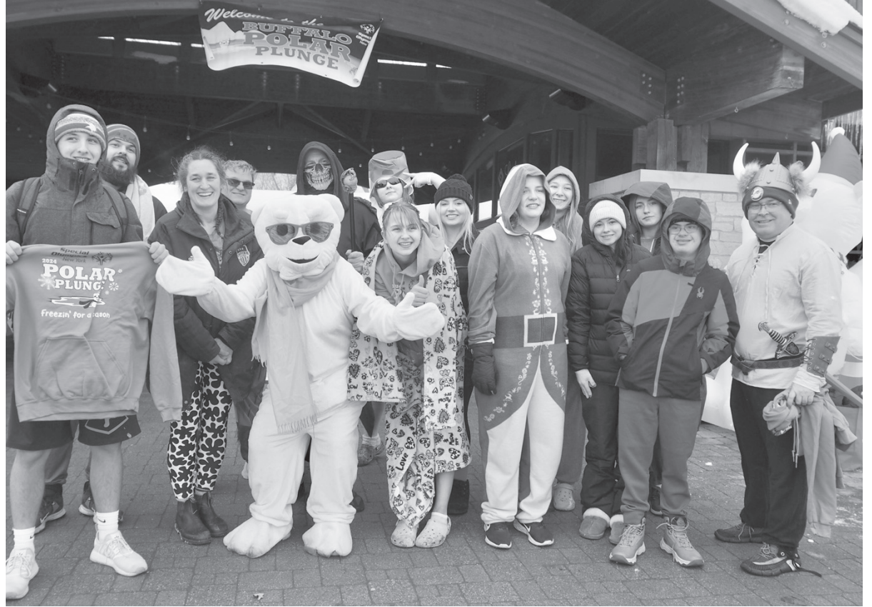
Above, Grand Island Central School District's Polar Plunge team, with friend Plungie (the bear). • Top, left: In costume and ready for the plunge.