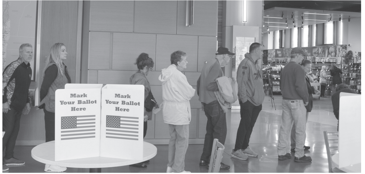
Voters line up inside the Grand Island Welcome Center to cast their ballots in early voting taking place there on Tuesday.