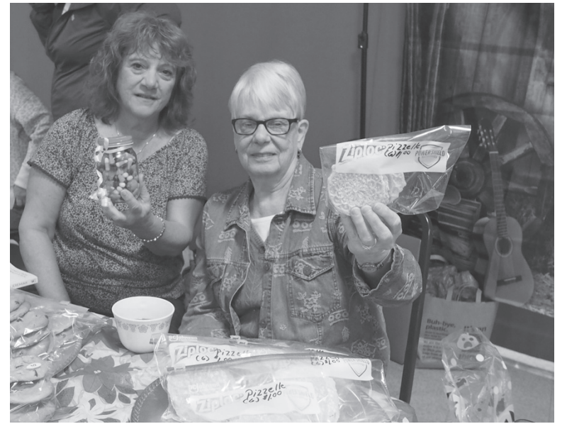
The bake sale, which included a variety of homemade baked goods.