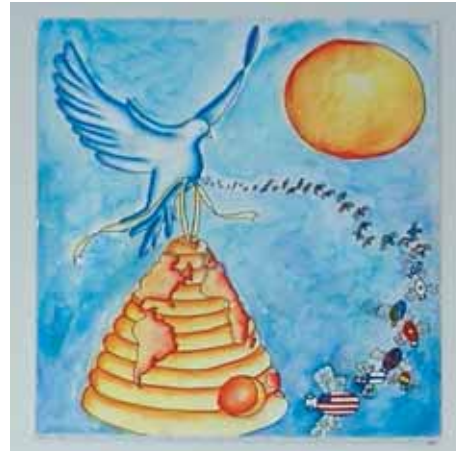
Molly Bloom 2nd Place Mult District 20