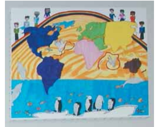
Hui Yang 3rd Place Mult District 20